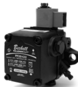
CleanCut XL PF20422